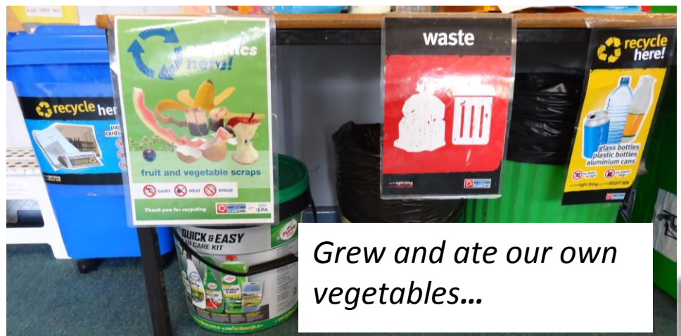
Grew and ate our own vegetables...