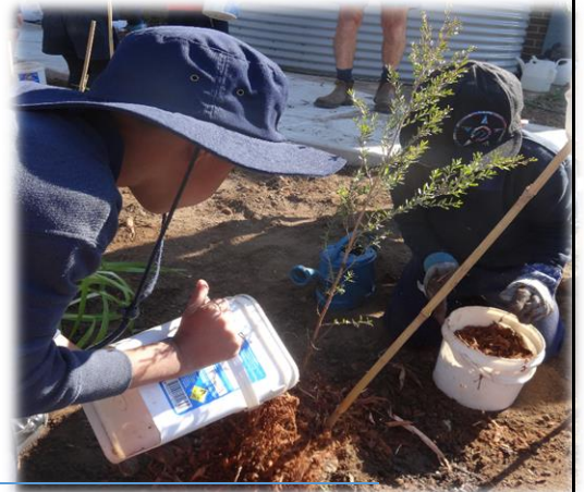
trees on Tree Day..