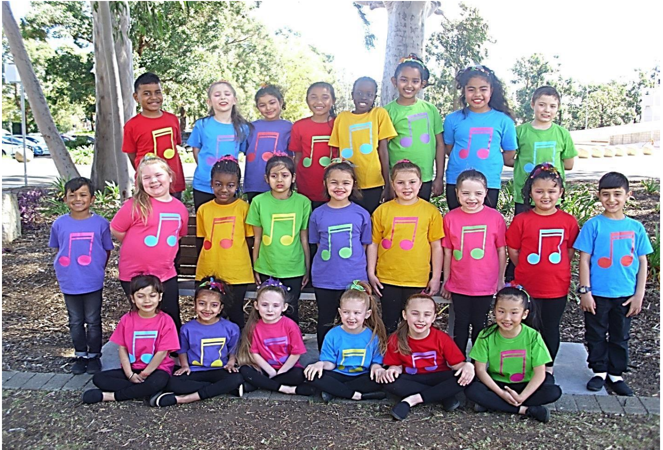
Stage 1 dancers in their 'Just Imagine' costumes